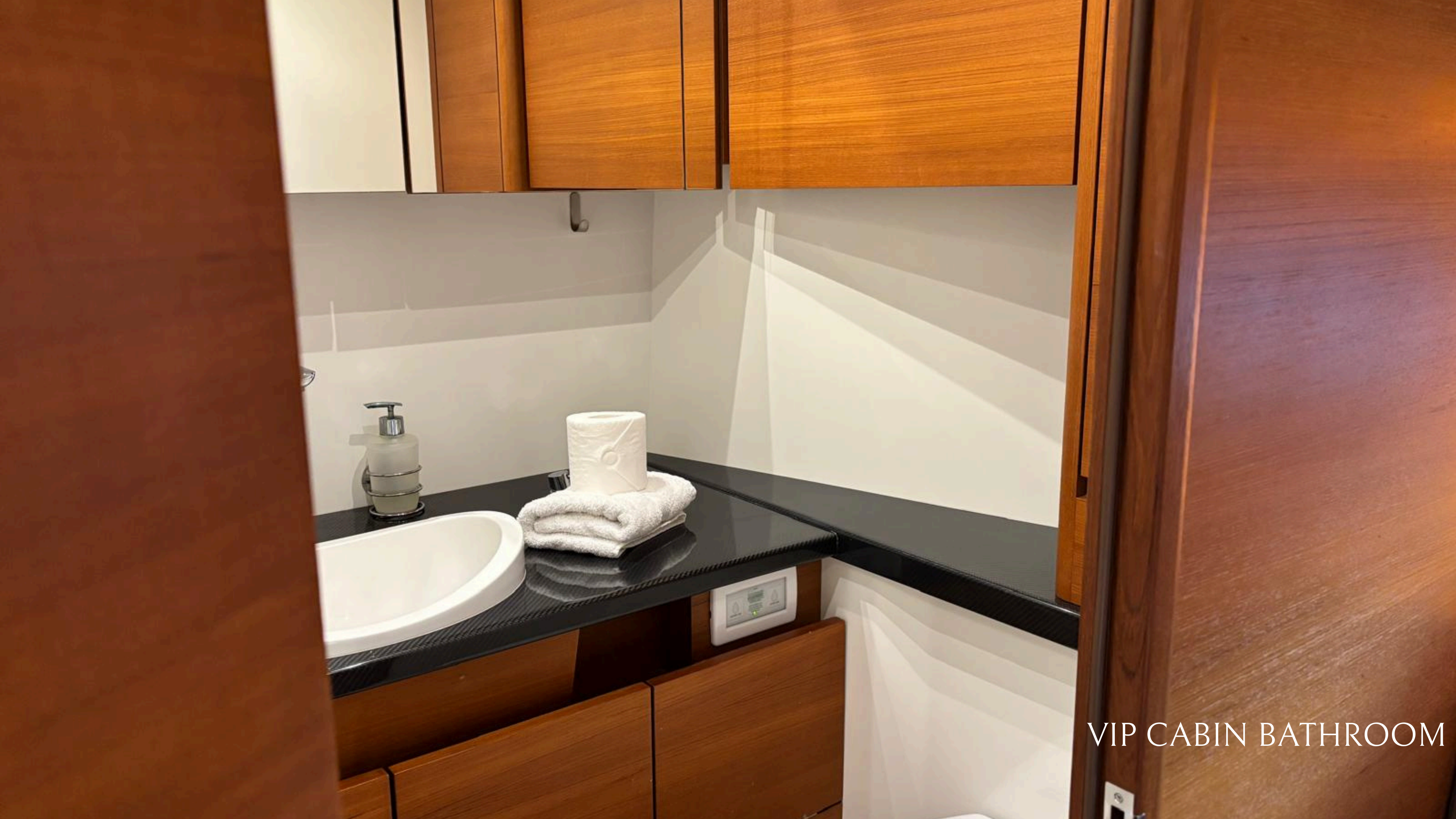
VIP CABIN BATHROOM