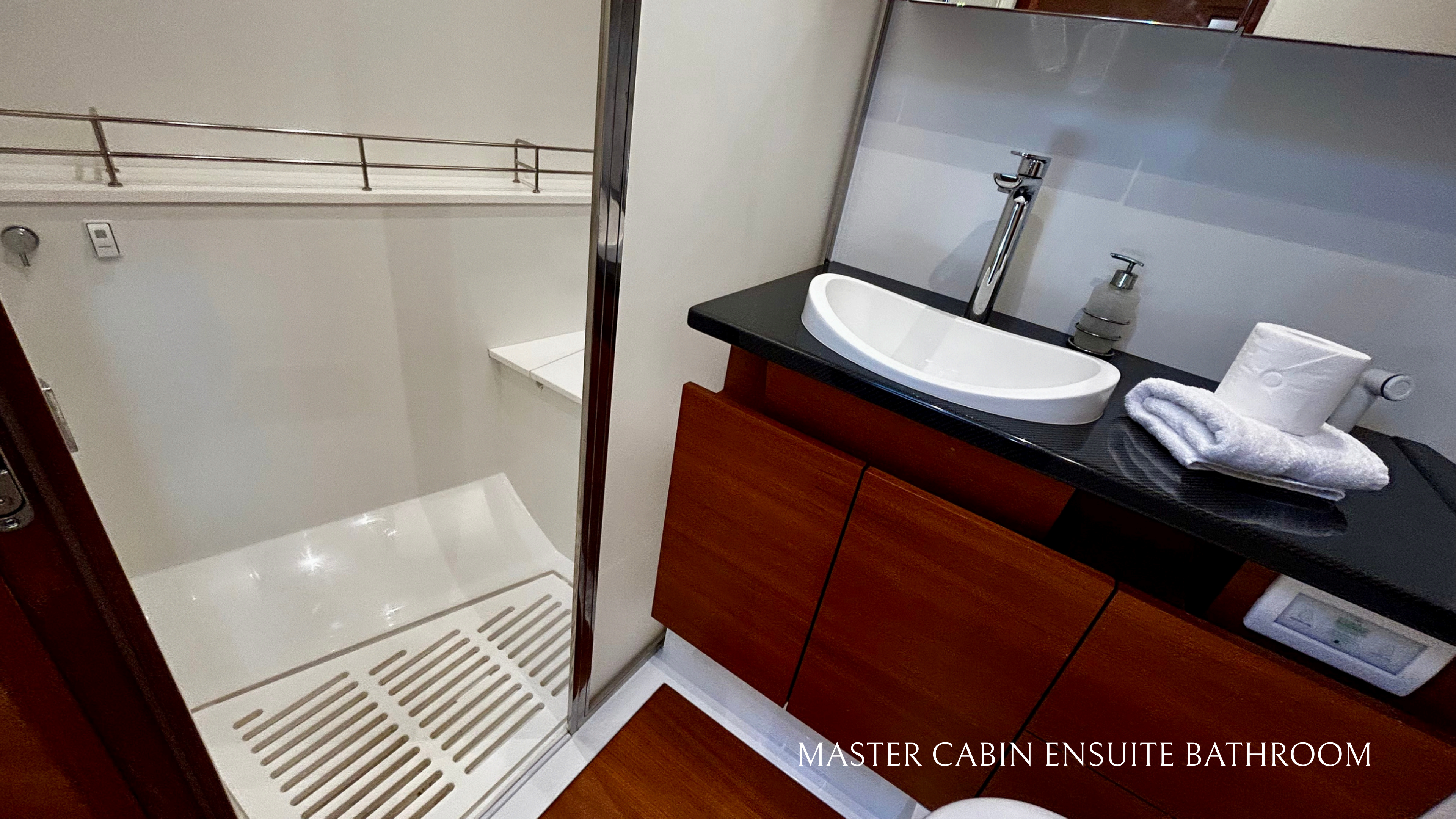
MASTER CABIN ENSUITE BATHROOM