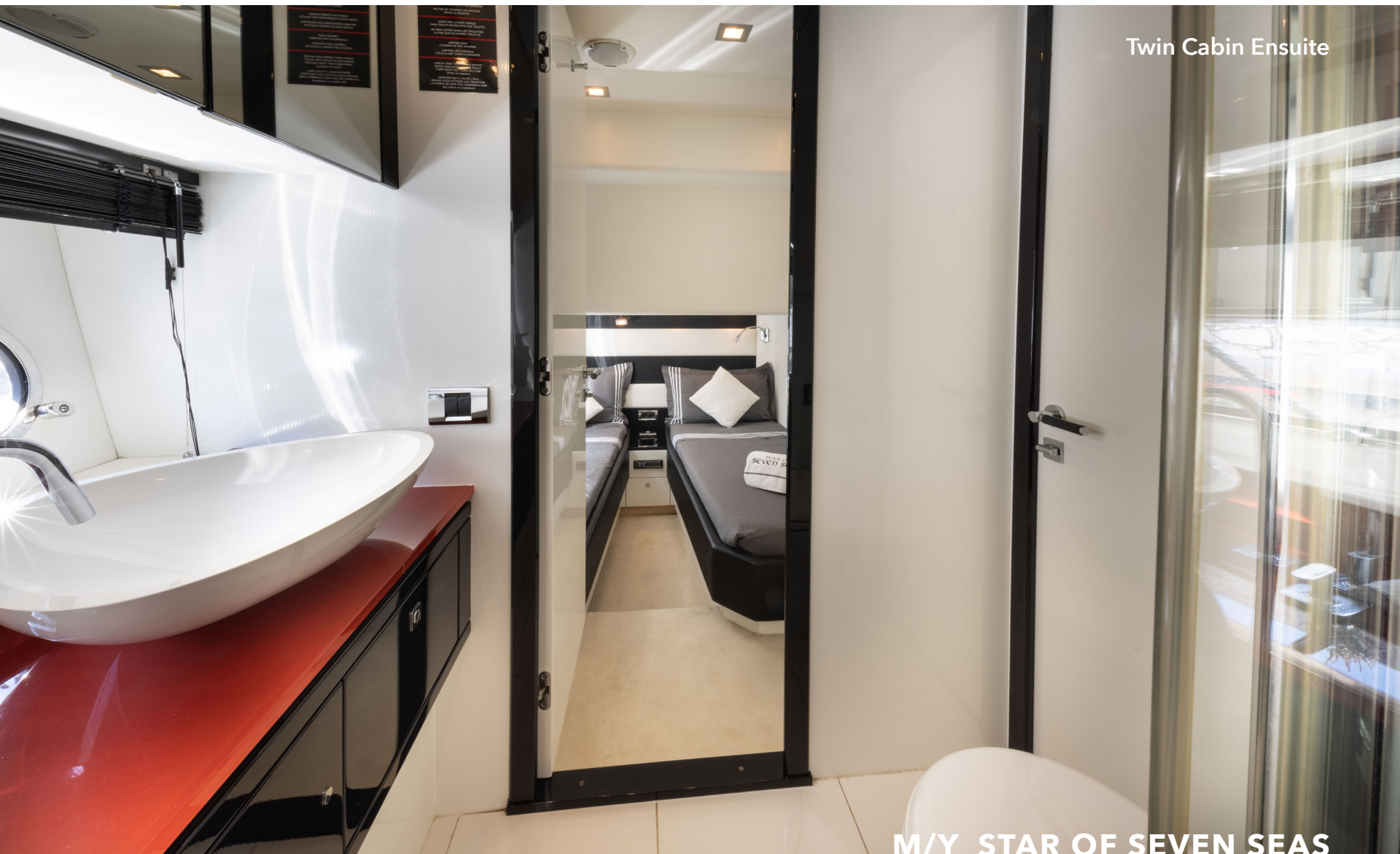
Twin Cabin Ensuite