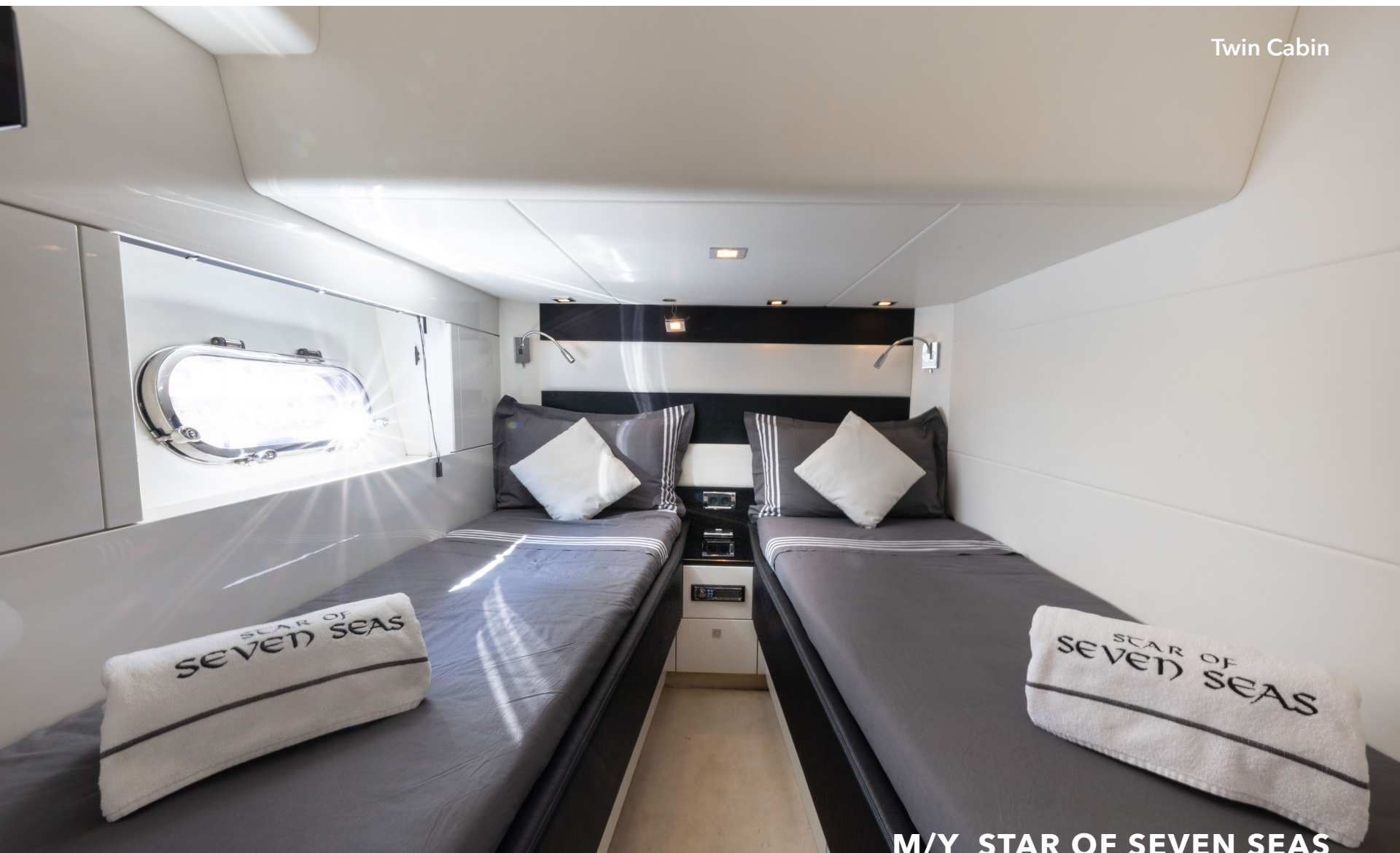
M/Y STAR OF SEVEN SEAS