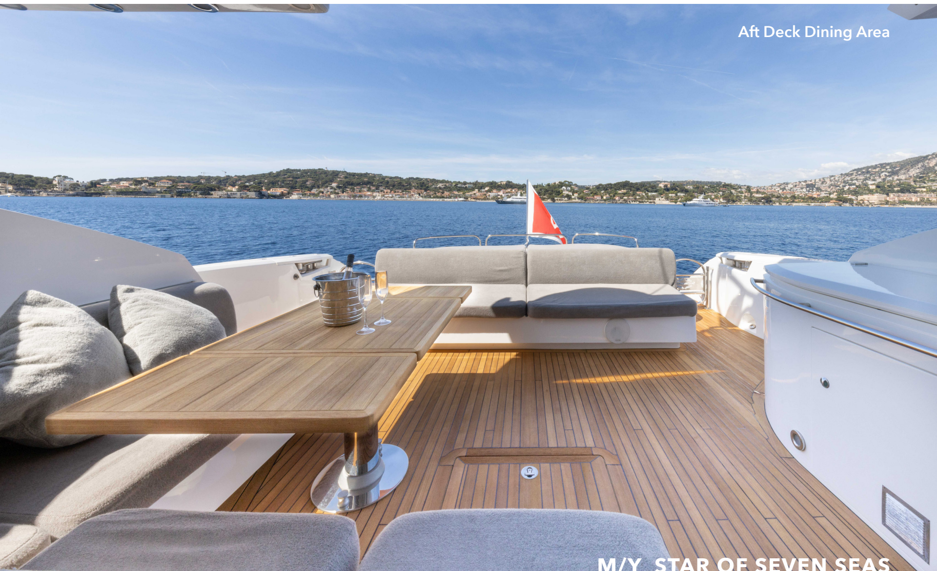
M/Y STAR OF SEVEN SEAS