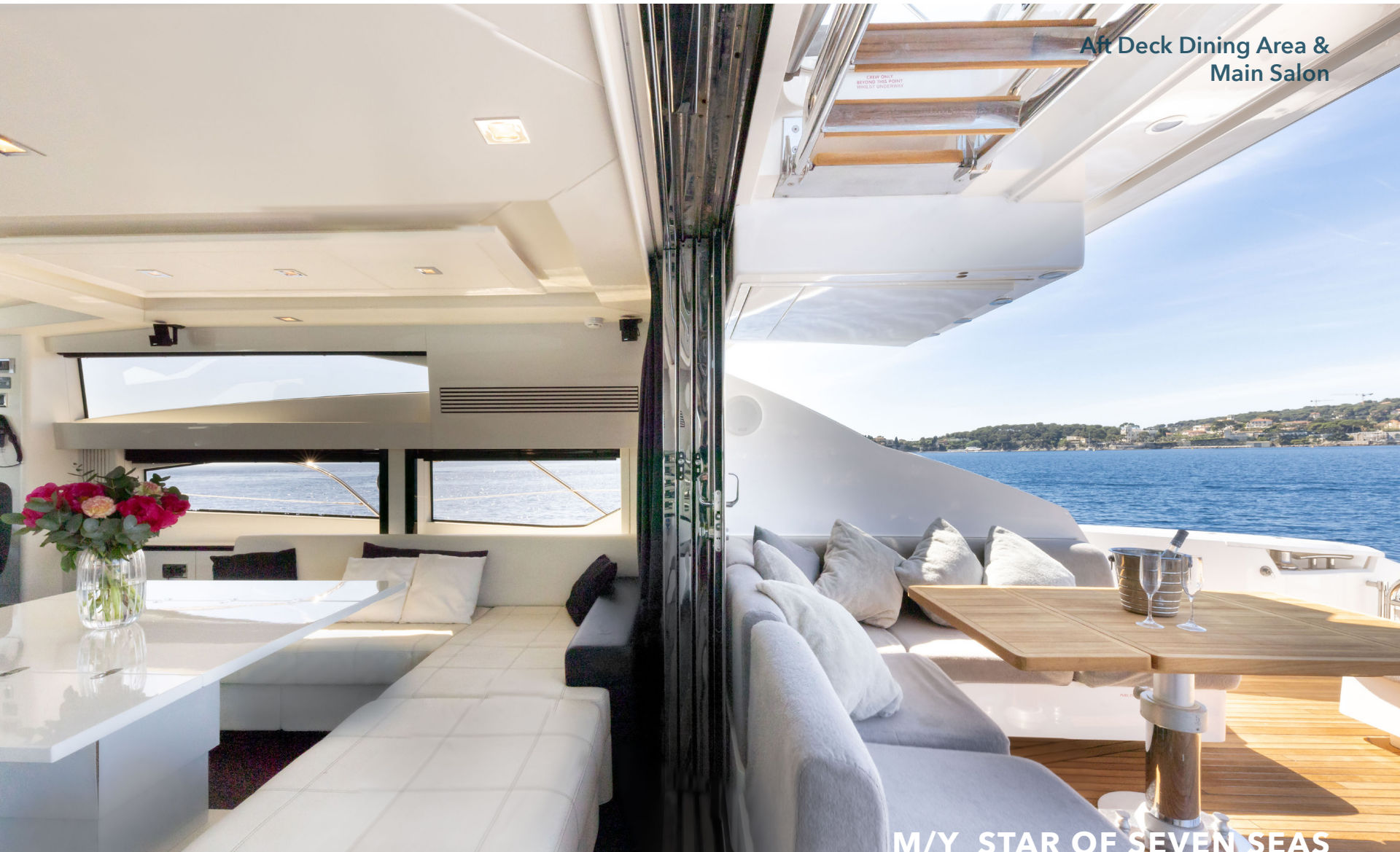
Aft Deck Dining Area & Main Salon