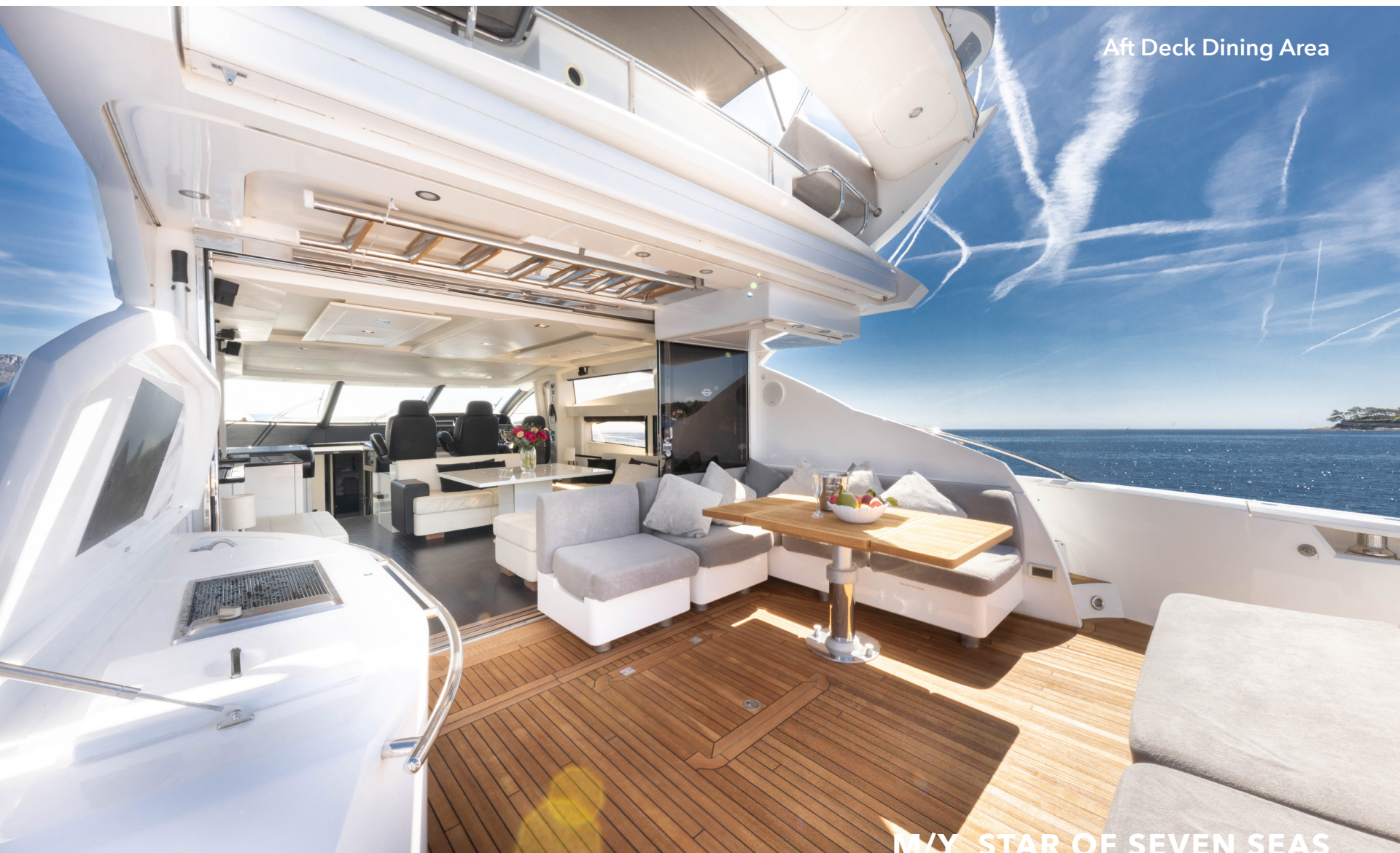
M/Y STAR OF SEVEN SEAS